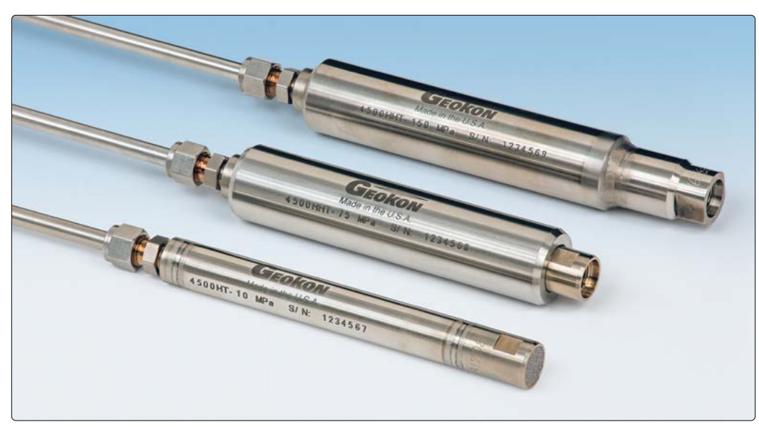
• Model 4500HT High Temperature Piezometer (front) and Model 4500HHT High Temperature Pressure Transducers (center, back).

The GEOKON® 4500HT Series High Temperature Piezometers and 4500HHT Pressure Transducers are designed for monitoring downhole pressures and temperatures in oil recovery systems and geothermal applications.